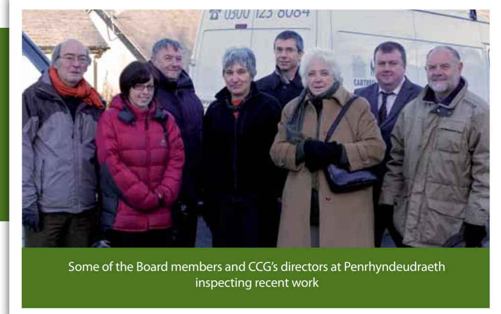
Some of the Board members and CCG's directors at Penrhyndeudraeth inspecting recent work

We believe that giving tenants a strong voice in the way that CCG is run is very important. A promise was made in the Offer Document that four out of the twelve seats on the Board were to be held by tenants. We believe tenants should be a part of